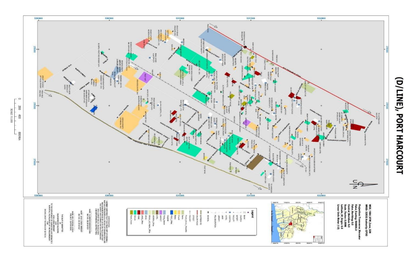
Fig. 2: Street Guide Map of Diobu Line

(A Monthly, Peer Reviewed, Refereed, Scholarly Indexed, Open Access Journal)